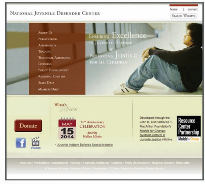
National Juvenile Defender Center Website

It takes time to build a relationship that will enable adequate and honest communication. Teenagers are often mistrusting of adults. Because many children charged as delinquents have abuse-and-neglect histories, they can be even more difficult to engage than their peers. Early appointment and a time-intensive commitment to develop the attorney-client relationship are needed to ensure that attorneys can execute their most basic duties. Attorneys who do not meet with their clients before the first hearing may not understand their clients' legal and nonlegal needs and are ill-equipped to properly advocate for them. Indeed, the failure of courts to appoint early counsel is one of the main impediments to competent, diligent, and zealous representation (National Juvenile Defender Center, 2012: 19).